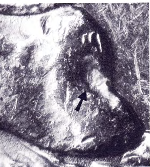
1881 O VAM 70 Die marker- Two Vertical Lines Rear Cap Depression