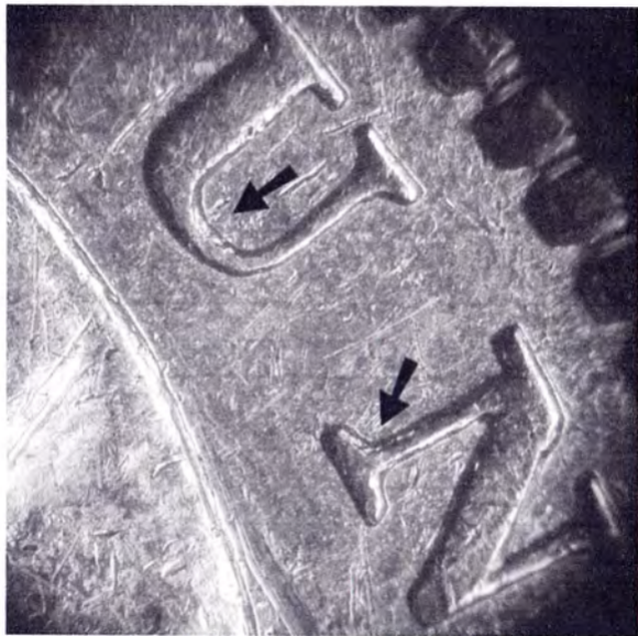
1881 O VAM 70 Doubled UNUM