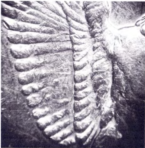
1881 O VAM 70 Over Polished Eagle's Right Wing