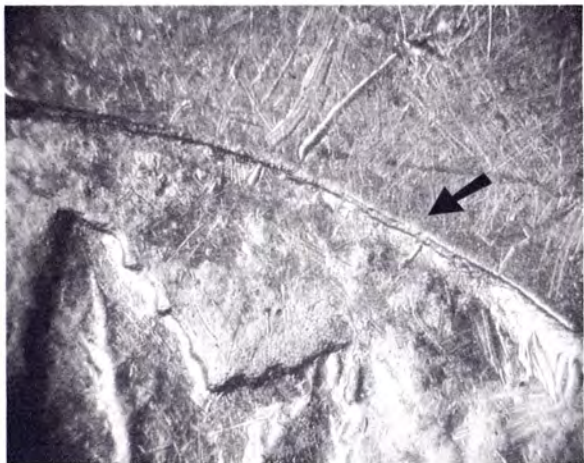
1881 O VAM 70 Doubled Cap Top