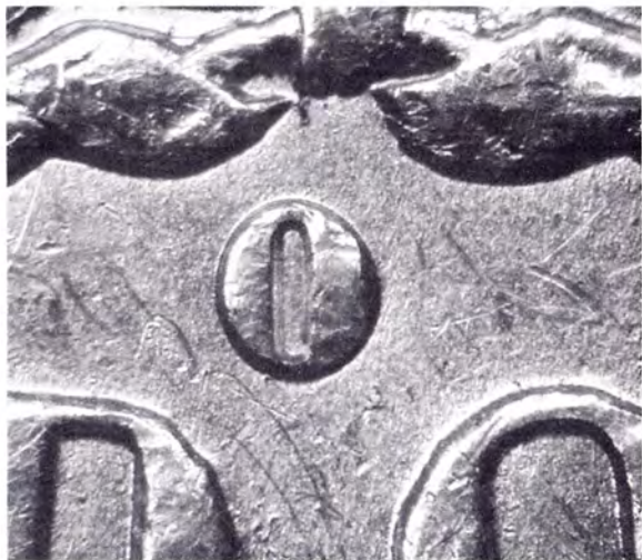
1881 O VAM 70 O Set Left