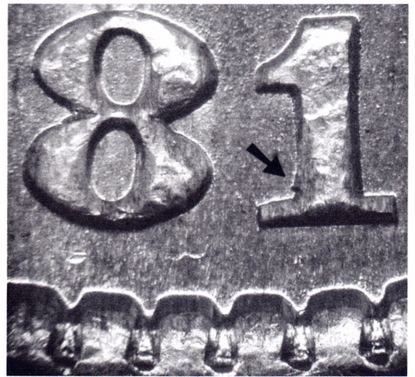
1881 O VAM 24 Die 2- Doubled Right 1 Shaft