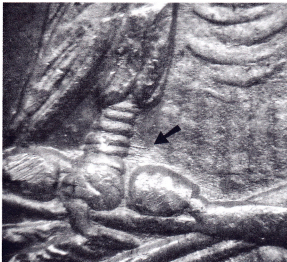
1881 O VAM 24 Die 2- Die marker- Lines at Eagle's Rt. Leg