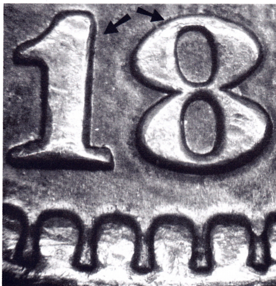
1881 O VAM 71 Doubled 18