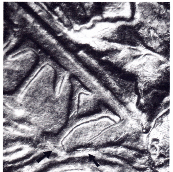
1881 O VAM 71 Die marker- Diagonal Polishing Line Y Bottom