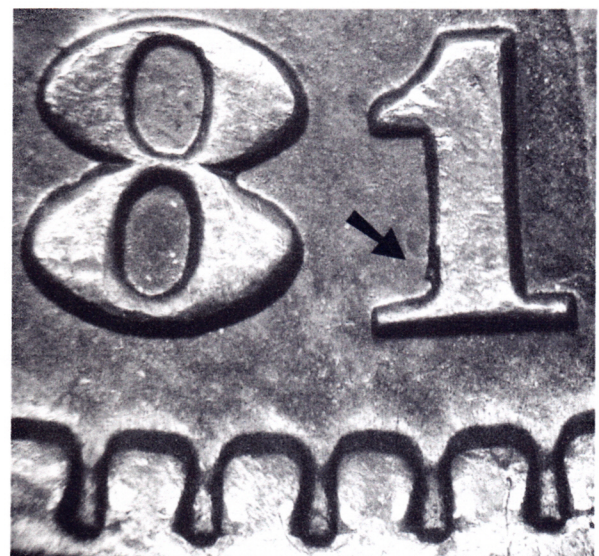
1881 O VAM 71 Doubled 1